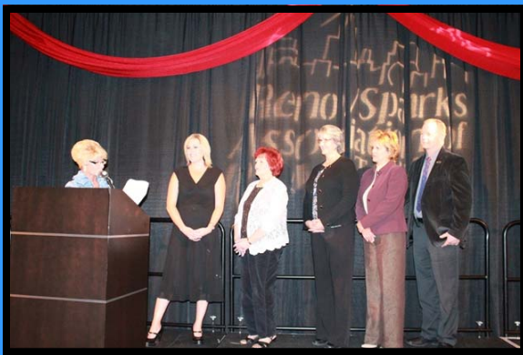
Installation of New Officers